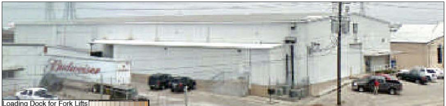
Loading Dock for Fork Lifts