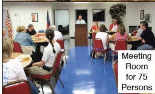
Meeting Room for 75 Persons

Del Papa Distributing has graciously donated the long term use of a 22,000 sq. ft. building on I-45 on Galveston Island. With the help of many donors, the Lighthouse Charity Team has been able to construct a commercial kitchen and acquire a large commercial rotisserie BBQ pit. The Team is excited about the future of this facility. Having the ability to respond to emergencies that arise in our communities will be much easier. Using this facility, along with the facilities in Friendswood, we will be able to support more people in a time of need. The facility also has 4,000 sq. ft. of furnished office space, a meeting room for 75+ people, and a loading dock for handling the mass amounts of food ordered and received on a regular basis!